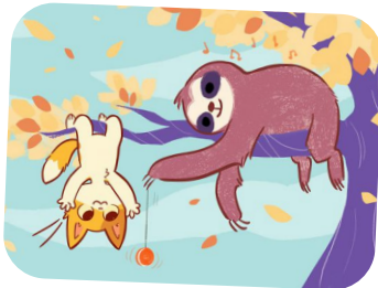
Keekee hanging out with a sloth like sloths.